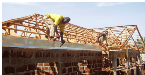
Construction of the roof nearing completion. The blocks were made from clay on the site.