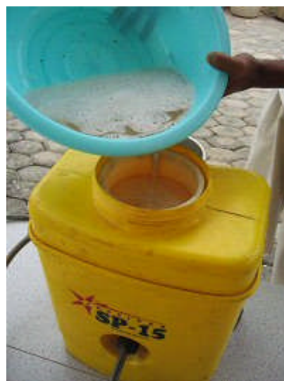
Step 6. Transfer mixture to spraying equipment and add water to make up to 15 litres. Use spray on crops within 8 hours of mixing.

Spraying of seedlings should take place as soon as they are planted (do not wait for the pest to appear). Use as a foliar spray on crops, covering both upper and underside of leaves. Can also be used as a soil drench by spraying the soil near the crop roots. Typical coverage for 50 ml of neem oil is 1,500 sq m 90.37 acre. For most crops it is recommended that spraying is carried out at 7 to 10 day intervals.