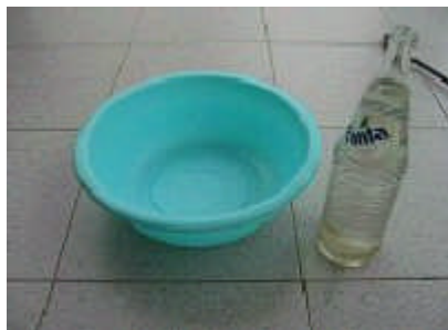
Step 1. Take 1 litre water and mixing container

50 ml of neem oil + 10 ml of emulsifier +15 litres of water