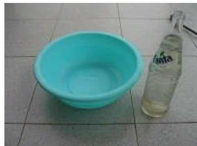
Step 2. Add 10 ml (one heaped table spoon) of black (or other) soap