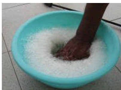
Step 3. Stir vigorously