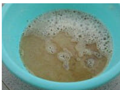
Step 5. Mix oil into water soap mix